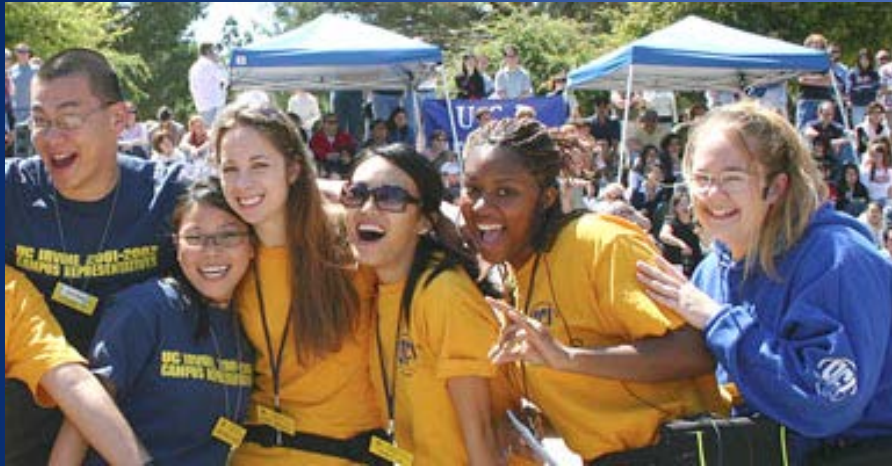
Students show their school spirit.