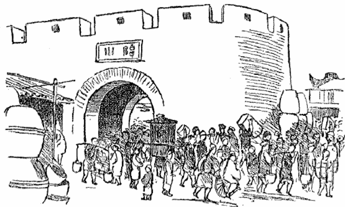
Gateway, native city of Shanghai

The irregular lanes which function as streets, with the filth and noise of these overcrowded communities are intolerable to our race, and one,