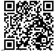
TU Support video for directions

https://www.youtube.com/watch?v=fKmhACaYbz8&t=358s