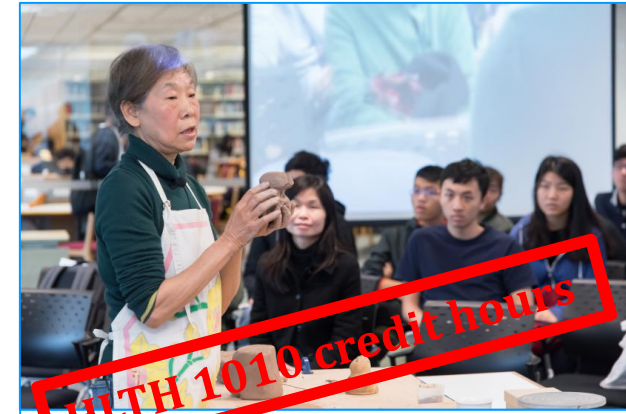
Ceramic Exhibition Talk & Demonstration