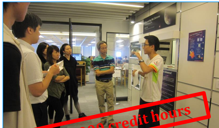
Discovering the Universe Science Student Led Exhibition Tour