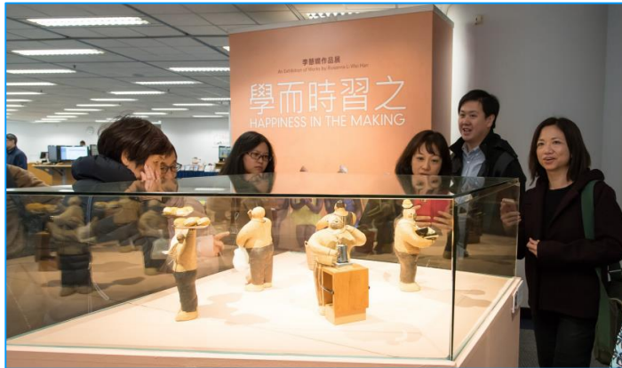
Happiness in the Making Ceramic Exhibition