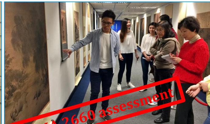
Re-creating Masterpieces Humanities Student Led Exhibition Tour