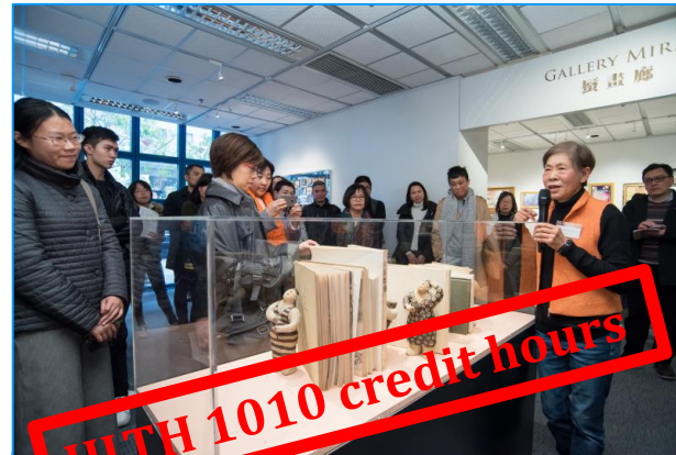
Artist Led Ceramic Exhibition Tour