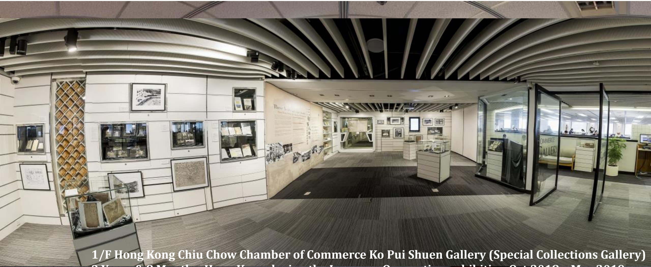
1/F Hong Kong Chiu Chow Chamber of Commerce Ko Pui Shuen Gallery (Special Collections Gallery) 3 Years & 8 Months: Hong Kong during the Japanese Occupation exhibition Oct 2018 – Mar 2019