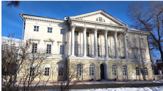
Irkutsk: Belyi Dom, home of Murav'ev-Amursky, Governor General of Siberia, 1847-1861