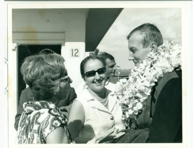
Evgenii Evtushenko 1966

Evgenii Evtushenko, Maxim Shostakovich, Avram Khachaturian, Joseph Brodsky, Victor Nekrasov, Bolshoi Ballet stars, Neva Dance Ensemble Mikhail Baryshnikov, St. Petersburg String Quartet, Moscow Shostakovich String Quartet, Moscow State Circus, Rudolf Nureyev, Alexander Godunov