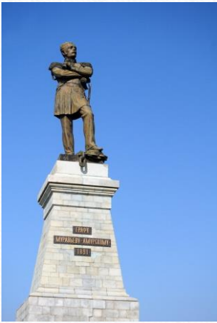
Khabarovsk: N. N. Murav'ev-Amursky